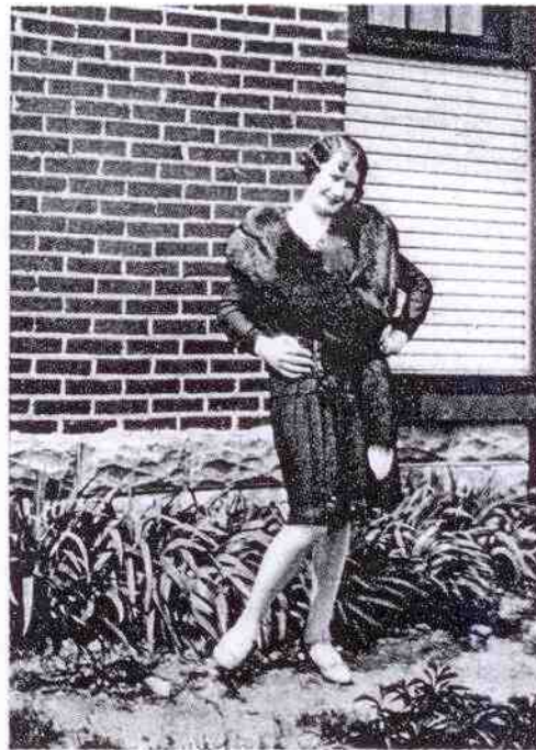
This photo shows some of the furs produced on the Alexandria Fox Farms which sold for $375.00 each in the raw.

During this period the dog fox mends his manners as a husband. When the vixen goes in to whelp he carries food to her and guards her against every danger. At the least unusual sound or strange sight he will give the danger signal or "cry." This can easily be heard for a quarter of a mile. One reason why it is so hard to steal or catch a fox is that they are ever on the alert and are practically