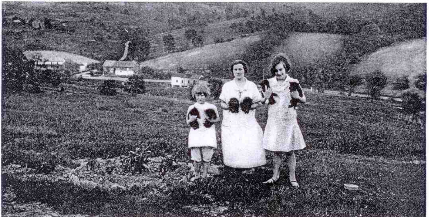
Fox puppies on the Alexandria Silver Fox Farm. Some real Kentucky scenery furnishes the background.

In writing this article, it has been my wish to convey to my fellow Kentuckians, or anyone else what may be interested, a correct and honest impression of the wonderful possibilities of Silver Fox farming in Kentucky.