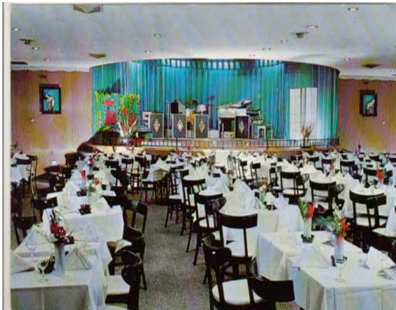
Interior of Silver Slipper, 1959

Messick recalls visiting the club as the Stardust in 1958. We remember the club as being the Silver Slipper in 1959-1960. Of course, it's likely the name was fluid and as in other locations, the gambling part in the back may have operated under a separate name. Chips from the days of the Silver Slipper and the Stardust have been found in Newport, but it is our feeling that these chips were never used in play at the clubs. Under all of its various names, the 613 Monmouth bar was more of a strip joint than a gambling location and it is very unlikely that the small back room where poker was played had chips, particularly in the denominations found. This was a bust-out, cash joint. The chips were more likely to be advertising tokens, not chips used in games.