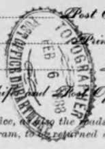
Diagram showing the site of the _____ Post Office in Township _____ (N. or S.), Range _____ (E. or W.) of _____ Principal Meridian, County of _____ State of _____, with the adjacent Townships and Post Offices.

It is requested that the exact site of the proposed or existing Post Office, and the roads to the adjoining offices, and the larger streams or rivers, be marked on this diagram, to be returned as soon as possible to the Post Office Department.