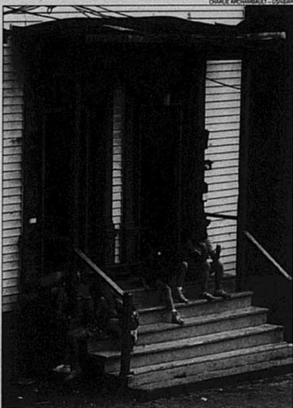
INNOCUOUSLY DECREPIT. White slums, like this Portland neighborhood, don't fit the sprawling-tenement stereotype.

Given the disparities between white and black ghettos, it's not surprising that white slums tend to be less violent and chaotic. Predominantly black ghettos have more families missing a father who might control errant children; they afford less opportunity for mobility out of the ghetto because of the persistence of housing discrimination and racism; and the communities have had longer to deteriorate. While crime is rampant in white underclass neighborhoods, random violence and murders are infrequent and drive-by shootings