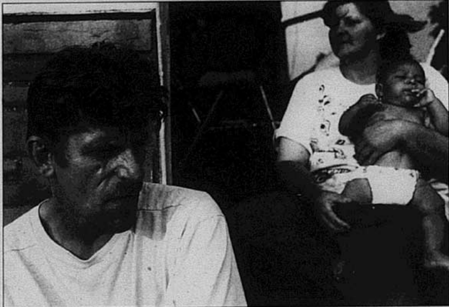
TRAPPED. This 37-year-old grandfather (foreground) wants to move his wife (holding grandson) and daughter (background) back to Tennessee from Detroit. But he can't afford to leave town.

This southwest neighborhood always had its toughs, but not white gangs like those there now. Al's Lounge, an old haunt of Hungarian workers, is boarded up, the walls covered with gang emblems. Several