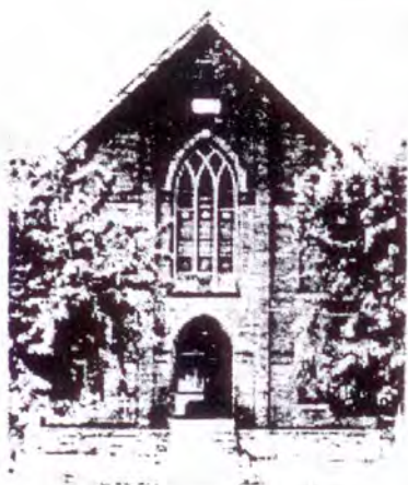
Scott United Methodist Church East Fourth Street Maysville, Kentucky 1884 - 1984

The First Presbyterian Church of Maysville is a prominent landmark in the city of Maysville. The white brick building with its 140-foot steeple dominates the West Third St. skyline and is the focal point of many paintings and photographs. The building was built in 1850 and has a dual staircase leading from the entrance to a second-story sanctuary. The sanctuary is known for its sound quality and is the setting for many concerts and recitals during the year. The stained-glass windows are beautiful, especially in the afternoon sun. The church participates in many community ministries and believes ministry in Christ's name is done through our building.