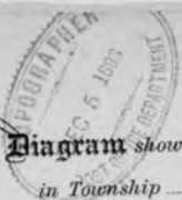
Diagram showing the site of the proposed Morris Post Office, in Township _____ (N. or S.), Range _____ (E. or W.) of _____ Principal Meridian, County of Bracken, State of Kentucky, with the adjacent Townships and Post Offices.

It is requested that the exact site of the proposed or existing Post Office, as also the roads to the adjoining offices, and the larger streams or rivers, be marked on this diagram, to be returned as soon as possible to the Post Office Department.